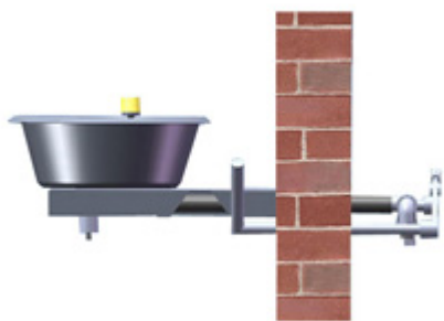
Size Eye wash model MB30 DDM

Created on: 08-05-2024 16:05:03 | Technical changes and imperfections reserved.