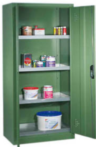
Size Chemical cabinet type CK40 - green