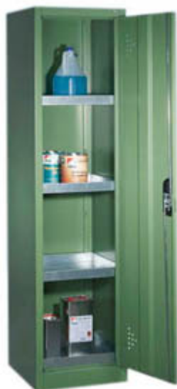
Size Chemical cabinet type CK20 - green