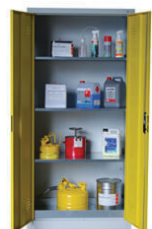
Size Chemical cabinet type CK40-LB