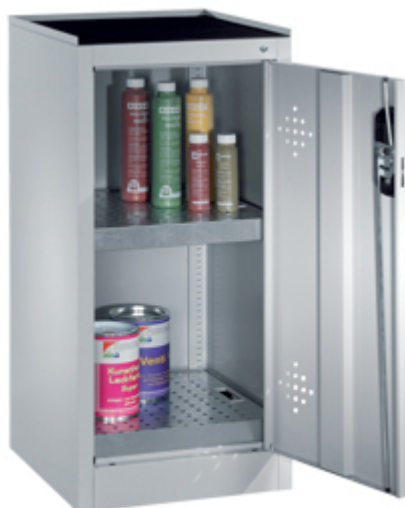
Inzetrooster en PE-antislipmat zijn optioneel