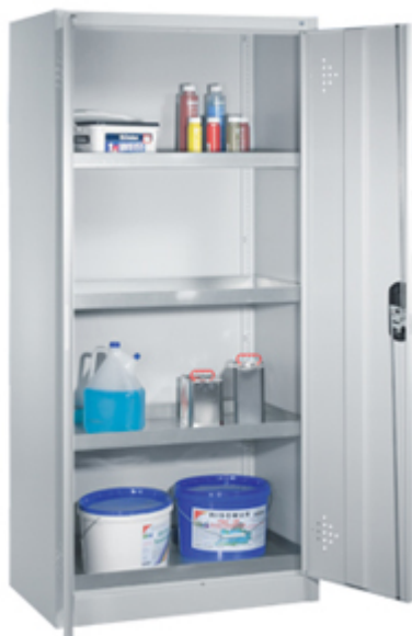
Size Chemical cabinet type CK40 - grey